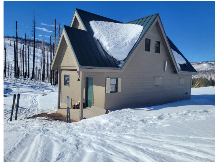
First Caldor Cabin Rebuilt - Finished, Jan '26

Please read the addendum carefully and abide by the directions listed.